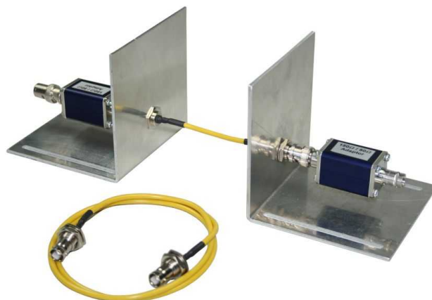
Calibration unit of EMCL (included as standard )